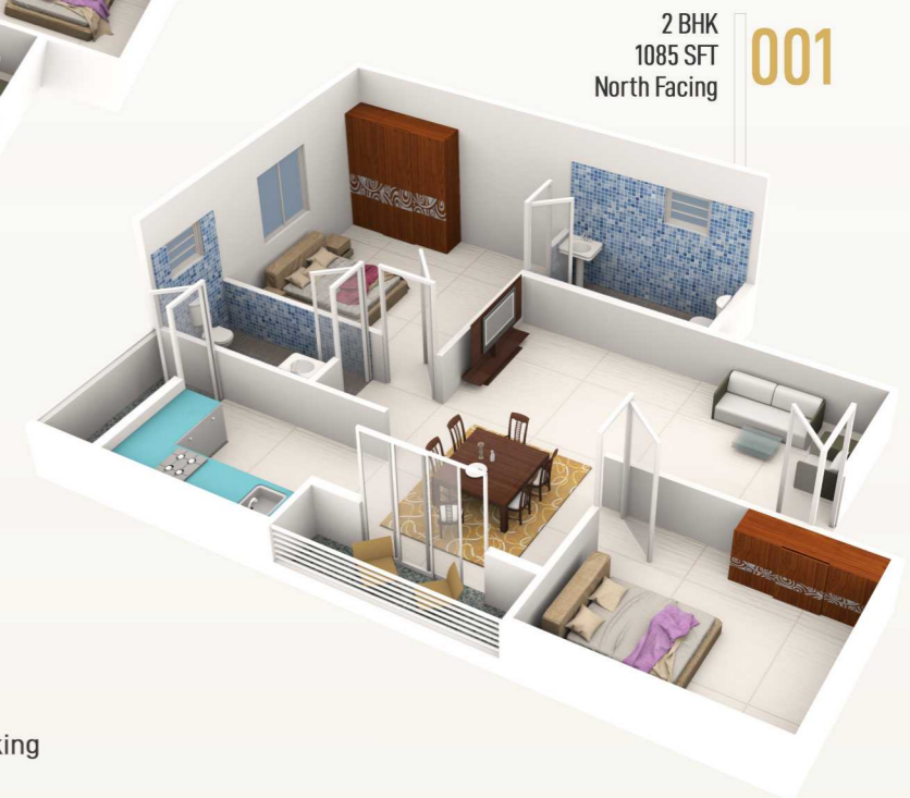
2 BHK 1085 SFT North Facing 001