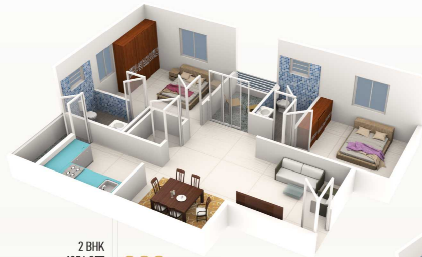
2 BHK 1056 SFT North Facing 002